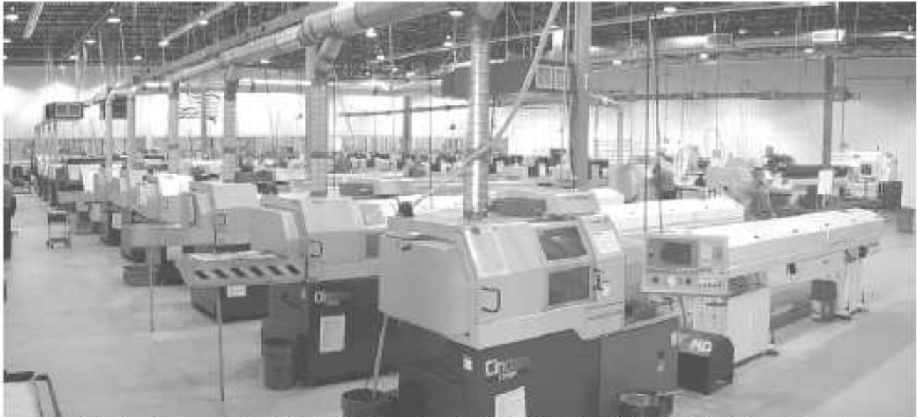
25 Citizen CNC, sliding headstock, multi-axis precision turning centers fill the main floor of the complex. Equipped with bar feeders, these machines are capable of producing 100% complete parts at incredible speeds. The parts can be turned to shape and size, then cross heads can mill the parts, drill them, taps them or slot them.