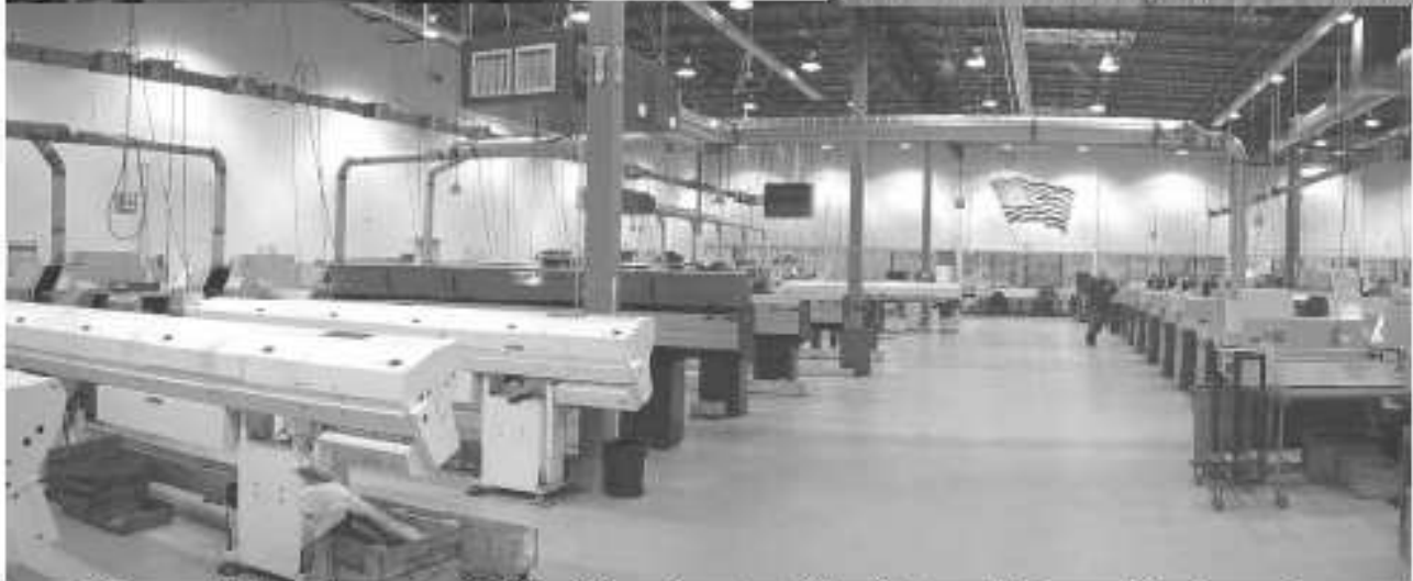
When you look down the center aisle in the Citizens department, it's a site to see all these machines in operation, but it's the American flag on the wall above the windows that really says it all.