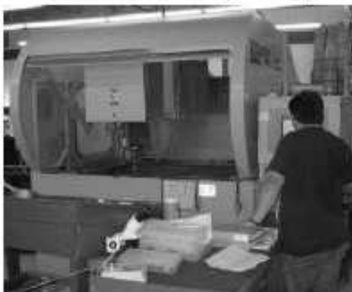
Water jet cutting is also available and some of the parts they have made are shown on the right.